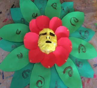
underway and the patience, perseverance over time. The end have come up with

The spring art – faces of flowers is well students are taking their time, learning and the art of working on something result will be a huge reward as they some fabulous creations.