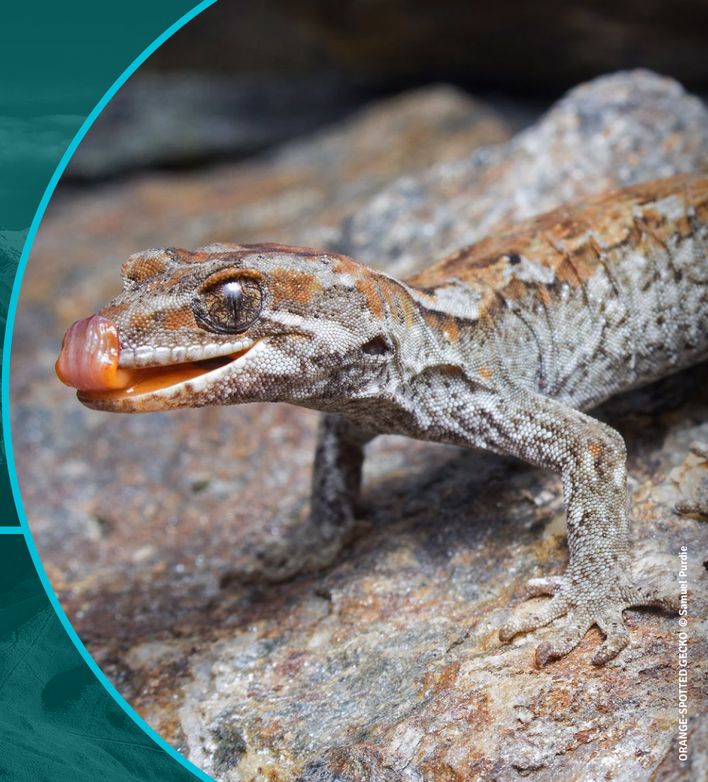
ORANGE-SPOTTED GECKO