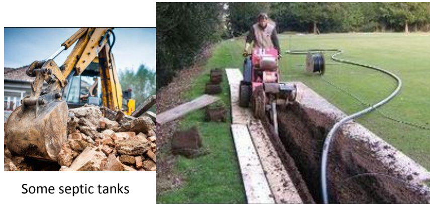
Some septic tanks decommissioned (upgraded)

WE THINK THIS IS MORE SUSTAINABLE ECONOMICALLY AND ENVIRONMENTALLY