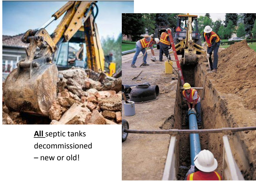
All septic tanks decommissioned – new or old!