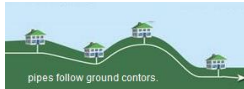
Smaller Pipes needed